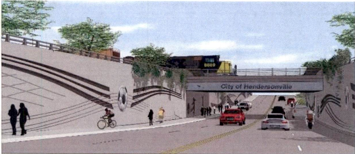
Illustration of the Future Grade Separated Crossing